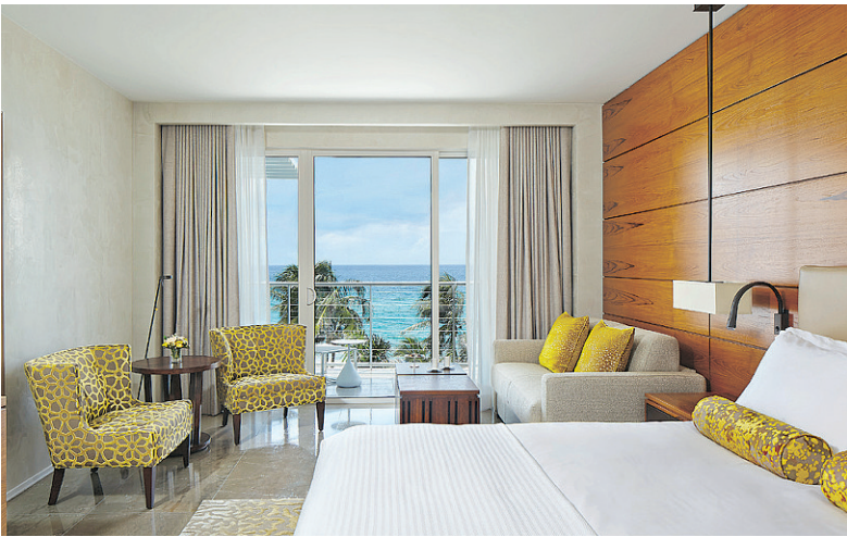
The 12 luxurious rooms and suites at the new Royal Blues Hotel in Deerfield Beach all face the Atlantic Ocean.

including in-room coffee, pool, beach setups, fitness room, Wi-Fi, evening turndown, parking. (From Oct. 1-March 31, 2017, it's $499-$589-$599-$1,079-$1,399 US) Greater Fort Lauderdale Convention and Visitors Bureau: 800-356-1662 or 800-22-SUN-NY/800-227-8669, sunny.org; Visit Florida: 888-735-2872, www.visitflorida.com.