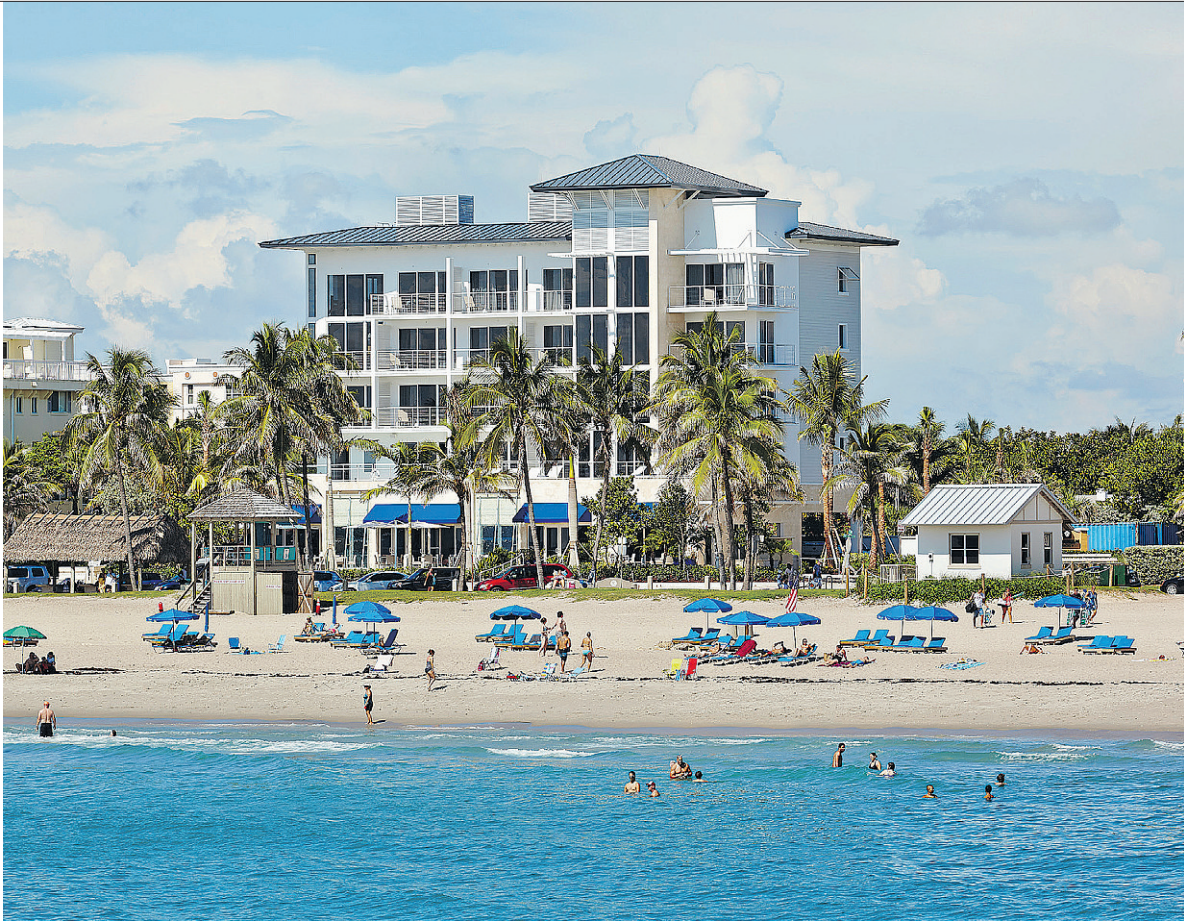
Royal Blues Hotel, north of Fort Lauderdale, is Florida's first Relais & Châteaux.

Newly built, the rooms have the latest tech controls. If you are an habitu   of five-star hotels, you've seen push-button drapes and showers with touch screen thermostats, but Royal Blues has more. Wait till you see the loo. Kohler's Numi model has a control panel, so I went to Settings and programmed for automated